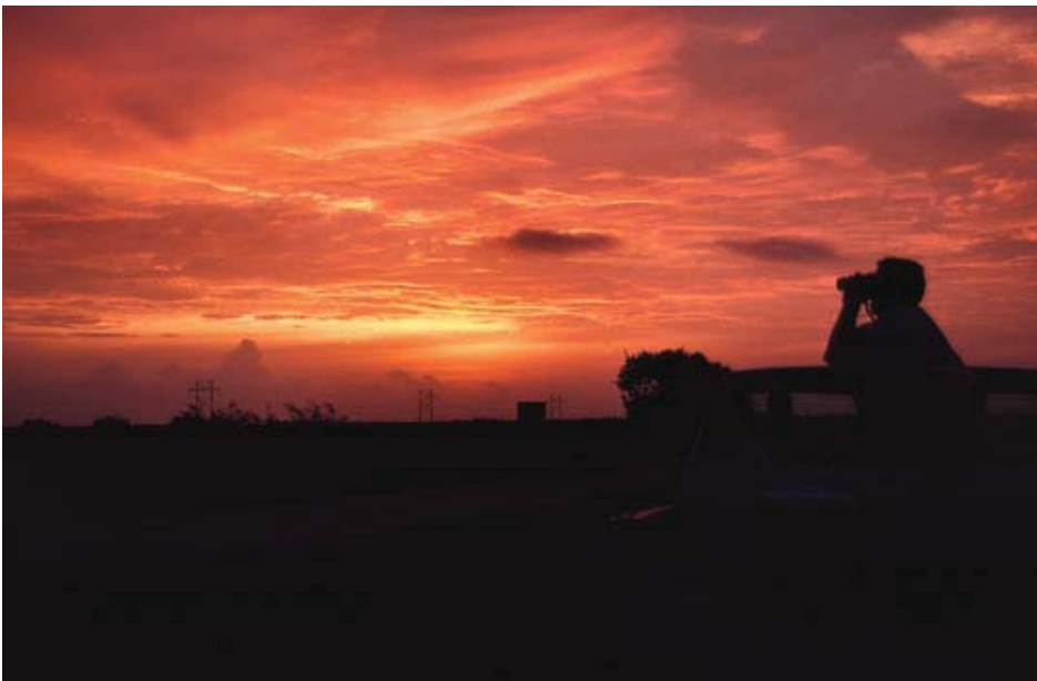
Gary Waggerman conducting white-winged dove fall-flight survey at dawn in the Lower Rio Grande Valley (photo by Roy Tomlinson, USFWS).

On a later trip to Mexico, Gary and I hunted white-winged doves and red-billed pigeons near La Pesca. The hunting and fishing were great, but not all of our trips turned out like that.